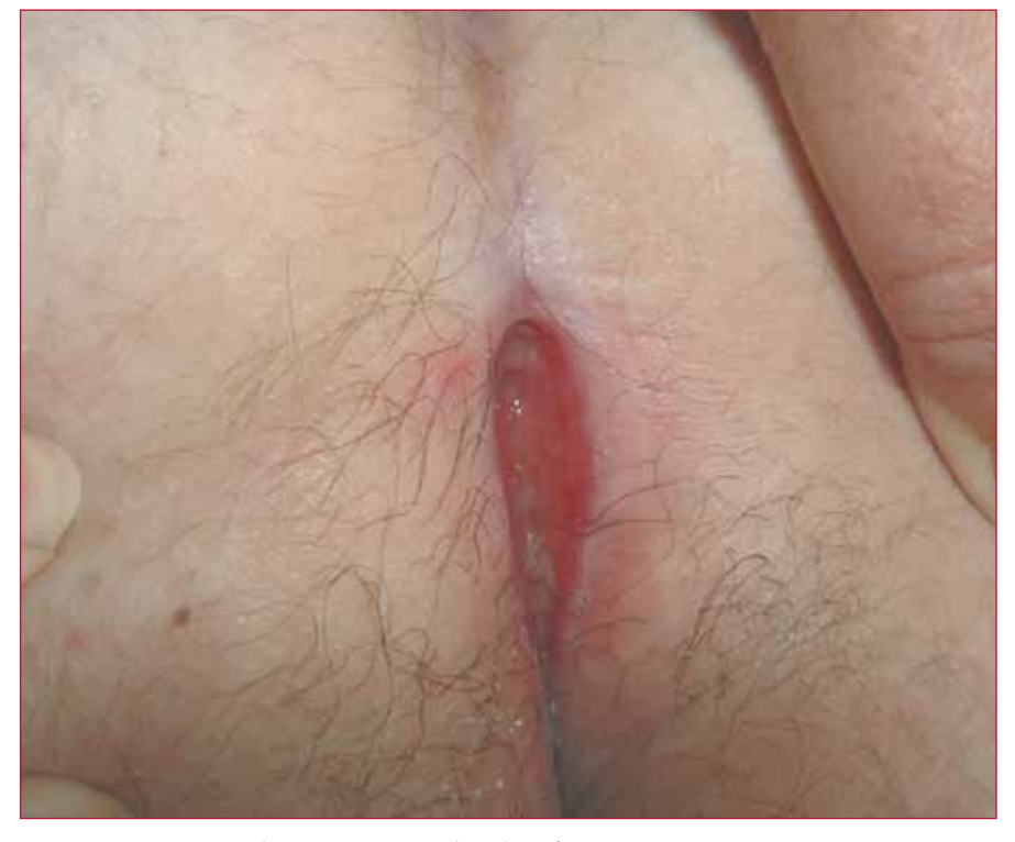
Figure 1. Patient 1: Initial postoperative wound resulting from incision and draining of a pilonidal abscess.

Mr S was a 19-year-old man who had a history of a pilonidal abscess that had been incised and drained. The postoperative wound failed to heal and further exploratory surgical intervention was required. The wound again failed to heal and at the time of the evaluation had been present for 18 months. Previous treatments had included various alginates and a hydrofibre. He had no previous medical history that